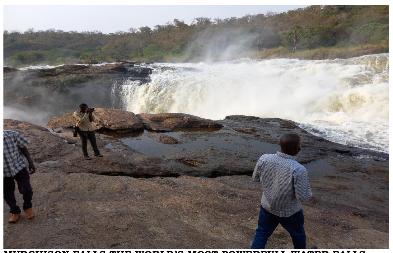
MURCHISON FALLS THE WORLD'S MOST POWERFULL WATER FALLS