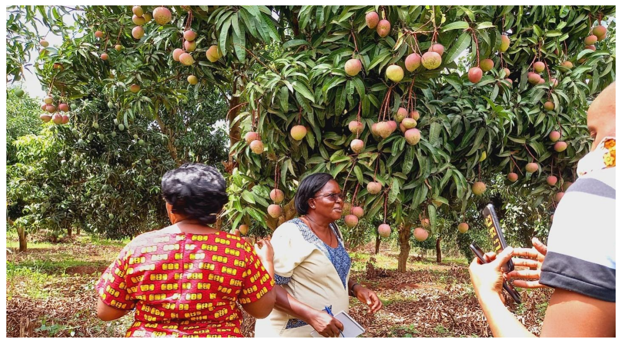
THE PHOTOGRAPH WAS TAKEN AT BIIZI MULTIPLE AGRO TOURISM FARM