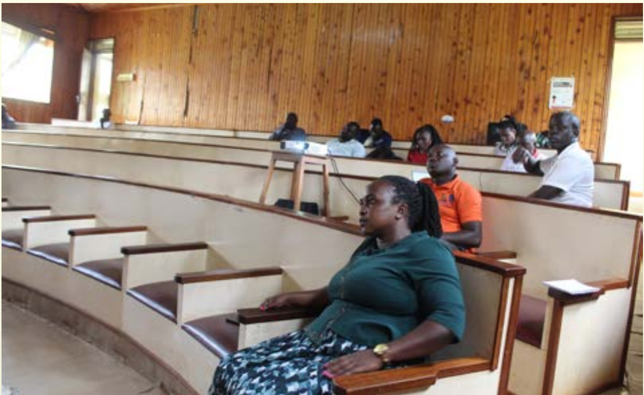
The members of the District Water and Sanitation Coordination Committee attending the quarterly meeting