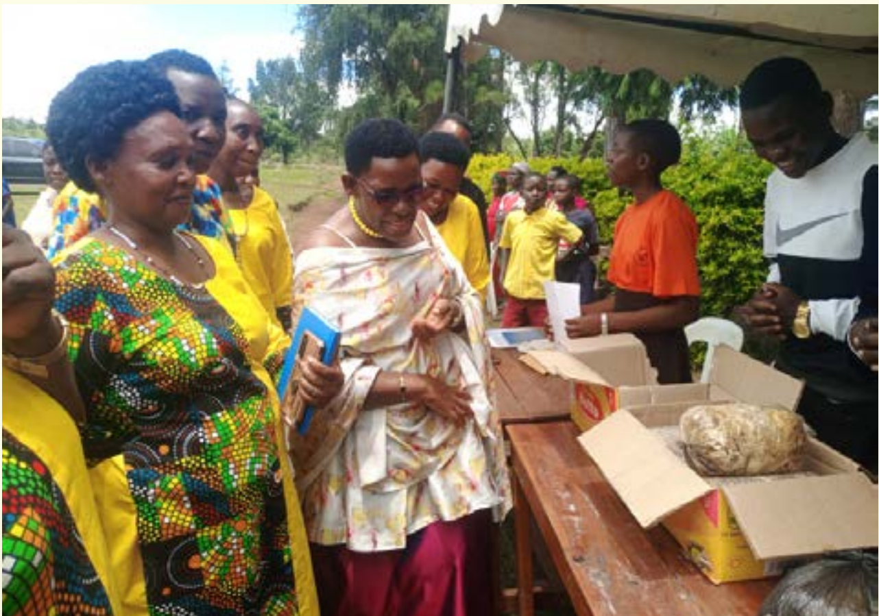
Hon. Mary Mugasa, State Minister for Public Service, inspecting exhibition stalls featuring various products organized by local women at Butema COU Primary School

The day was celebrated with a number of activities including an exhibition of different projects by women, cervical cancer screening, HIV testing and entertainment from several schools and drama groups.